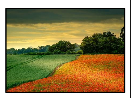
November: A poppy field in Dorset