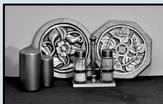
'Lockdown #09' by Miguel Carmena on Flickr