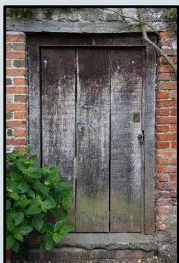
'Locked Door' by Trevor Meacock