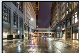
'Coronavirus'