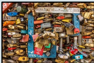
'Padlocks' by Lauren King