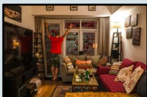
'Lockdown' by Si Glogiewicz on Flickr