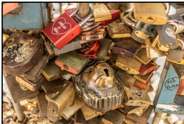
Image: Padlocks

The committee hope all bhpc members are staying safe and well, and with luck this is the only 'lockdown edition' we need.