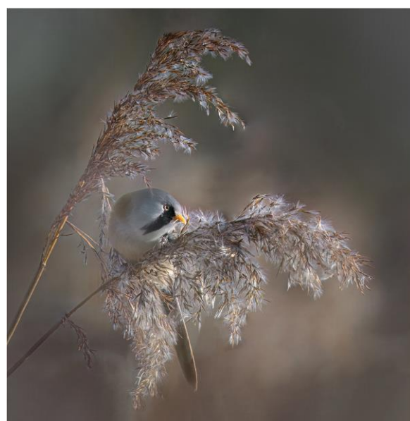
'Bearded Reedling emerging on a windy day' by Amanda Cunningham