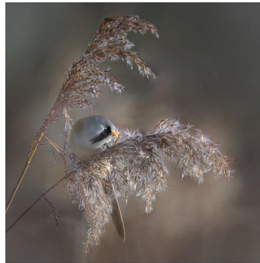
'Bearded Reedling emerging on a windy day'

We meet on Wednesday's at Muscliff Community Centre Shillingstone Drive BH9 3LR